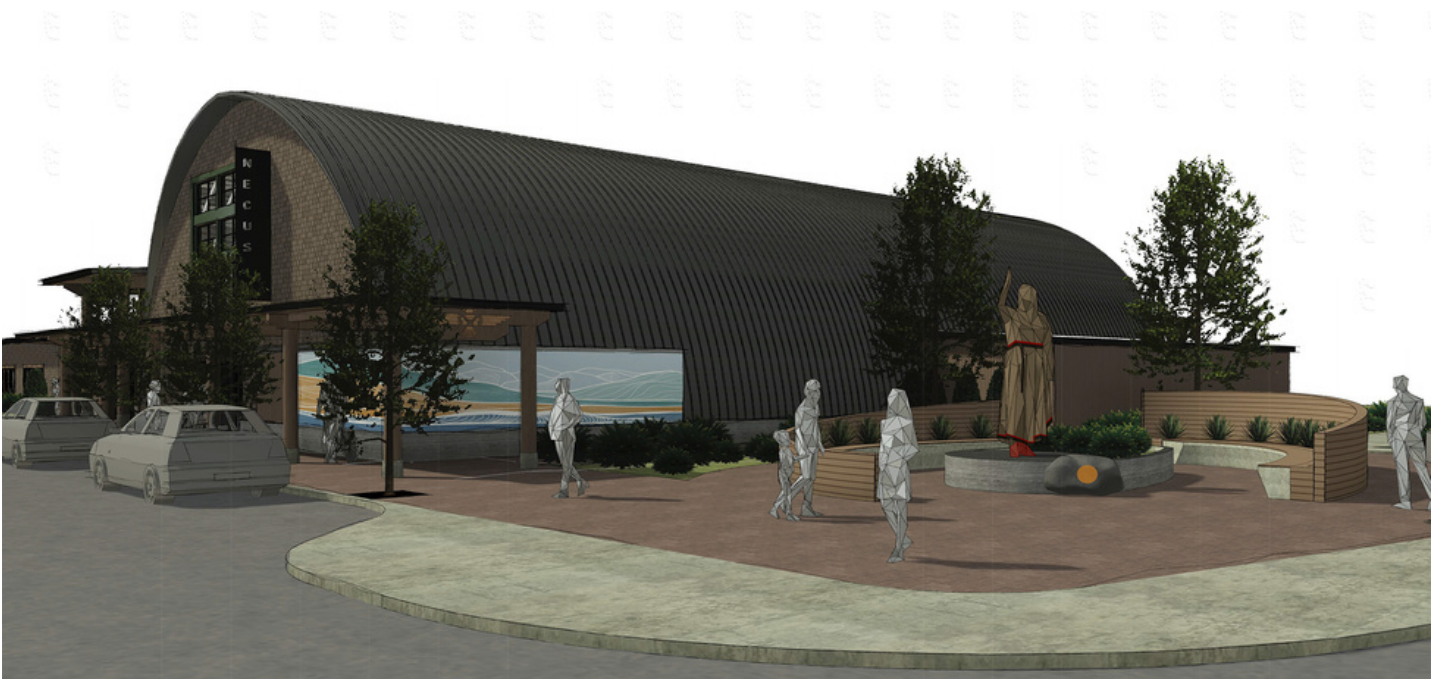
A preliminary rendering of the welcoming plaza