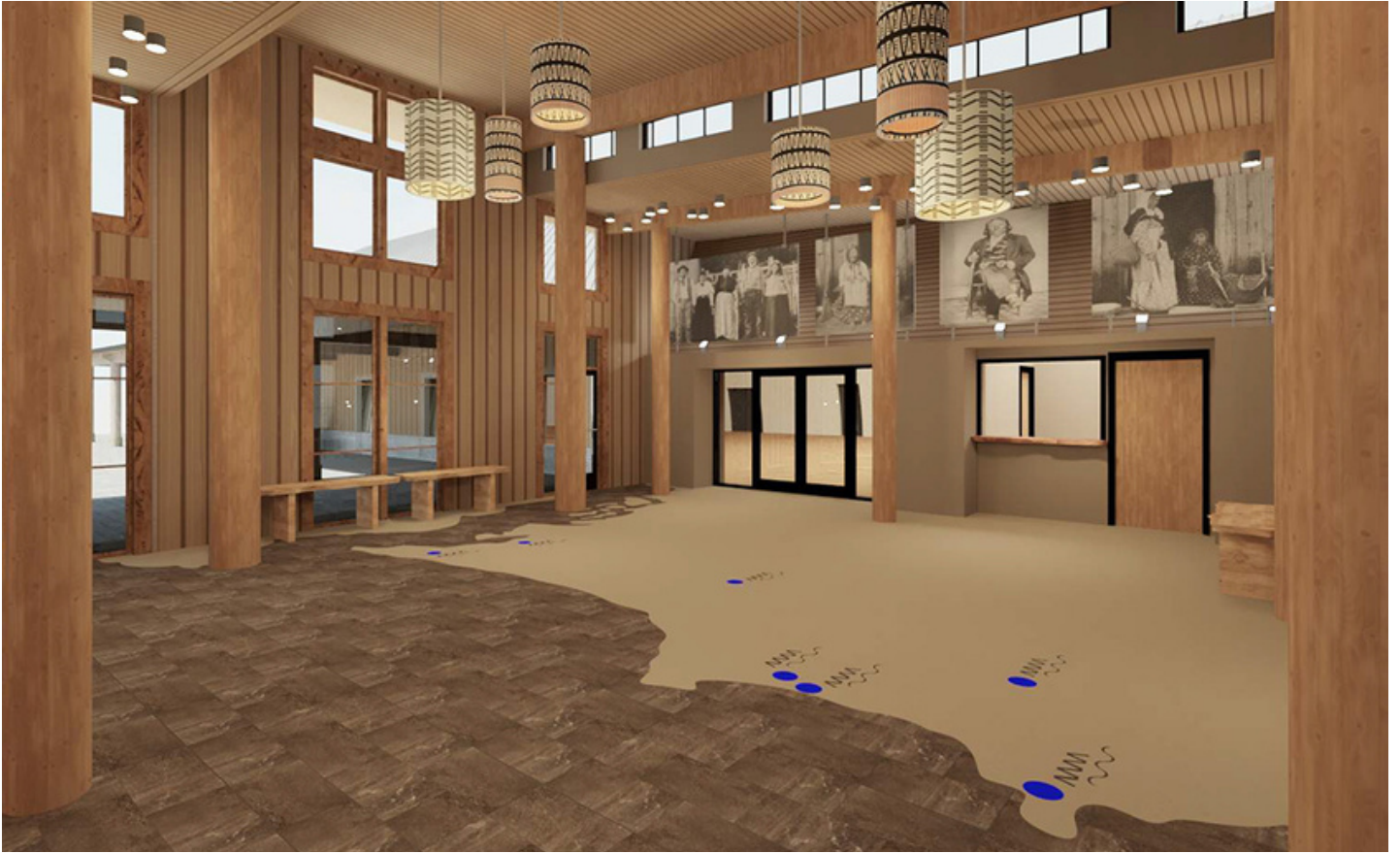
A preliminary rendering of the proposed Lobby