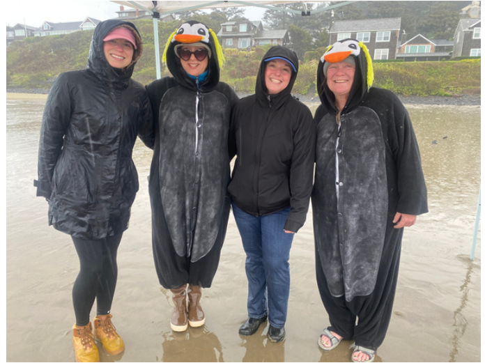
Puffin costumes at the Welcome Home Puffins event