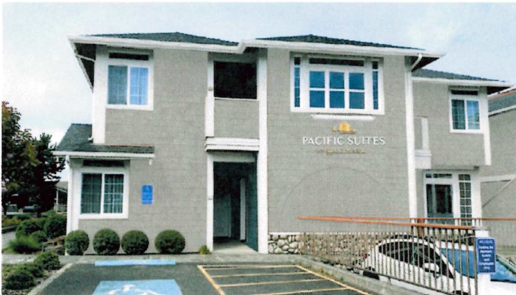
East Side of Building