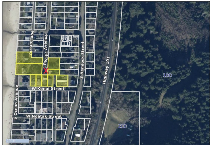
S Pacific Ave