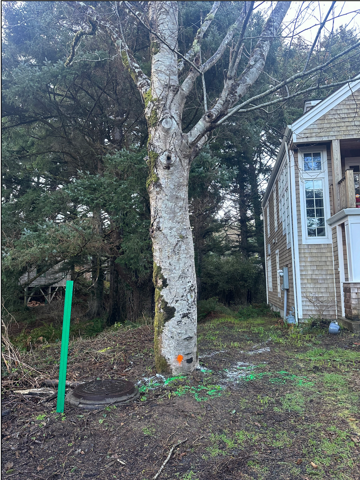
Alder tree located on City ROW (note proximity of manhole cover)

Treescaples Northwest P.O. Box 52 Manzanita, OR 97130