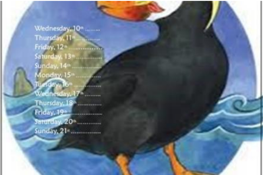
12 Days of Earth Day - 2023