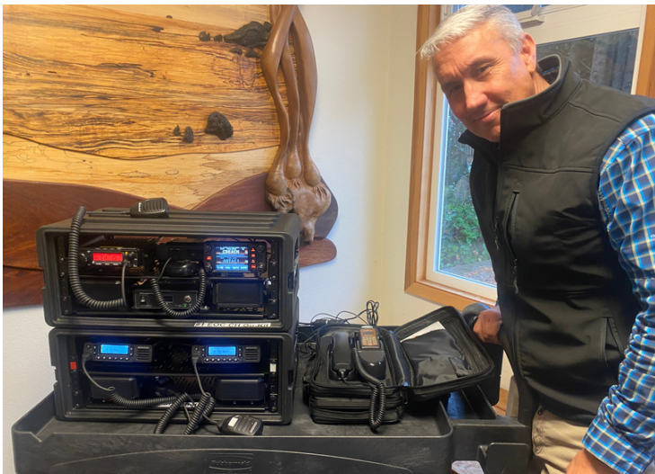
Radio equipment at City Hall