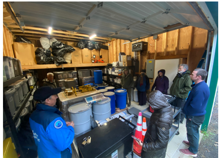
Inside the Oscar cache site