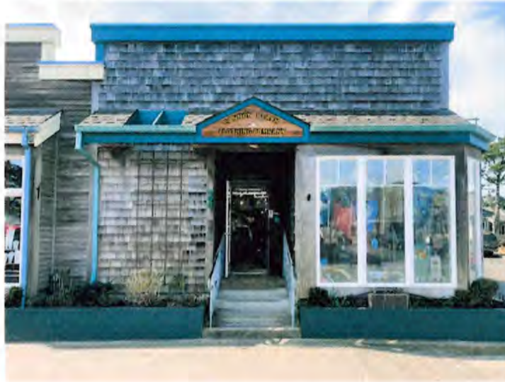
Sign Above Entry Door