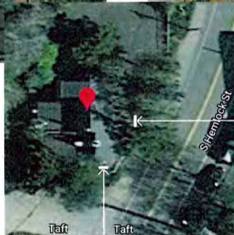
Building SideSign Location