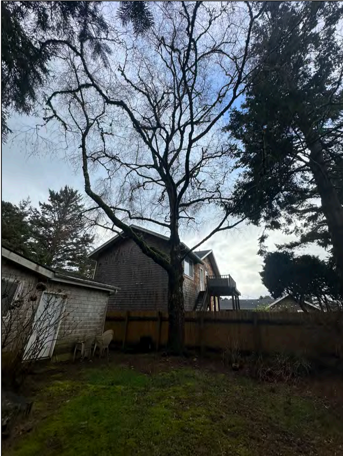
Birch tree in the backyard @ 232 E Van Buren

Treescaping Northwest P.O. Box 52 Manzanita, OR 97130