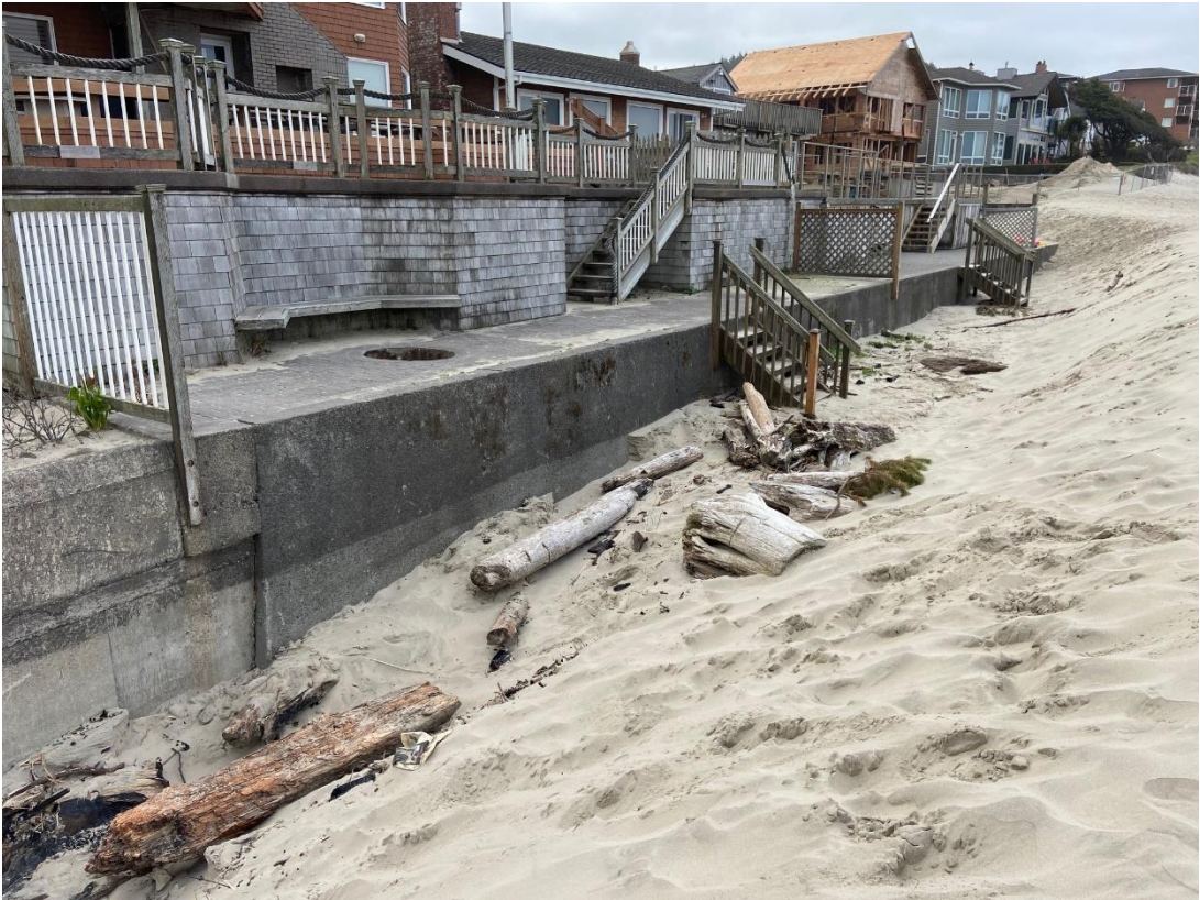
SITE PHOTOGRAPH – APRIL 29, 2024